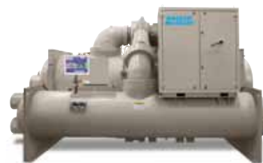
400 to 700-ton Magnitude™ Chiller Water-Cooled Chiller