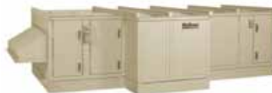
Skyline™ Outdoor Air Handler 900 to 65,000 cfm