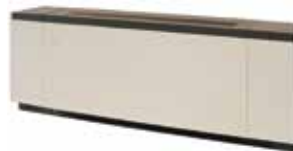
Unit Ventilators 750 to 2,000 cfm