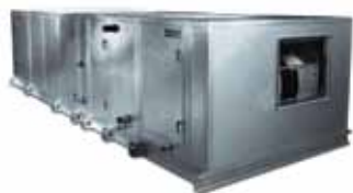
Vision™ Indoor Air Handler 900 to 100,000 cfm

Choose a McQuay Air Handler or Terminal Unit