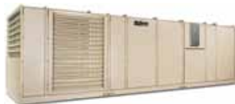
RoofPak™ Outdoor Air Handler 4000 to 50,000 cfm