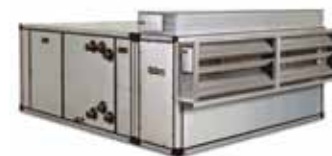
Destiny™ Indoor Air Handler 600 to 15,000 cfm