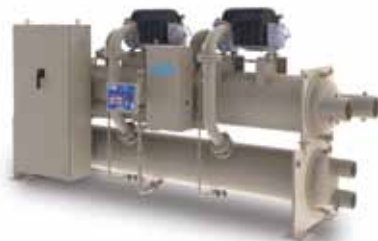
100 to 400-ton Magnitude™ Chiller Water-Cooled Chiller

Choose a Daikin McQuay Magnitude™ Chiller