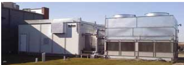
The McQuay Modular Central Plant is one example of a system that provides the efficiency and reliability that data centers and mission critical facilities require.

If environmental responsibility is one of your goals, our systems can help you reduce the carbon footprint of your facility, without sacrificing efficiency or reliability. With efficient McQuay equipment, your HVAC system may qualify for incentives from the government or utility companies.