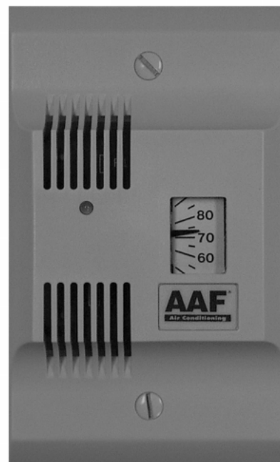
Table 1. MicroTech Sensor Part Number

This device provides electronic sensing of room temperature at wall locations and features a thermistor temperature sensor and a green LED for unit status, tenant override switch, setpoint adjustment potentiometer, thermometer, and communications port.